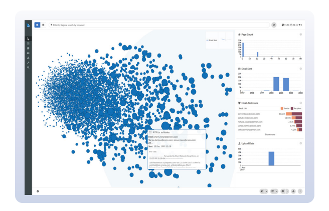
Understand the entire dataset at a glance with Luminance's Al-powered data visualisation

Dentons' Dubai office was tasked with a vast, time-sensitive document review. Whilst initially the client believed the project would involve around 200-300 documents, this soon encompassed over 180,000 documents. To help complete this huge task in just two weeks, Dentons turned to the power of Luminance's AI following a recommendation from within the firm.